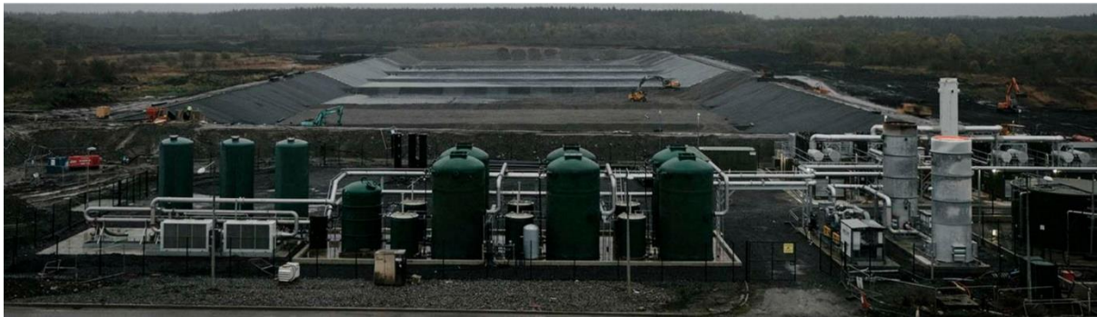
Figure 2 - CrumRubber Biogas Plant installed as part of a 5MW Landfill Gas Utilisation Plant at Dredid Landfill, Ireland

The application was characterised by the exceptionally high levels of H 2 S given the technologies ability to cope with such high H 2 S levels, the affinity CrumRubber has for Volatile Siloxanes, and the low operating cost when compared to more conventional technologies, it is clear that CrumRubber will have a big future in enabling energy recovery in the form of clean biogas and landfill gas in the resource recovery sector.