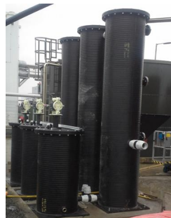
Figure 1 - CrumRubber Pilot Plant

As part of an extensive research program in the early 2000's to develop a catalytic roughing filter for H 2 S removal Bord na Mona identified Crumb Rubber as an ideal media with the capability to catalytically remove and convert H 2 S to sulphate. The Sulphate deposited on the surface of the crumb rubber media (origin of material waste automobile tyres). The media could be regenerated by continuous or intermittent flushing with water. Typical removal efficiencies for levels from 10 to 200 ppm of H 2 S ranged from 30 to 70 percent. Initial attempts to get the media to operate as a support media for biological treatment were not successful and this was attributed to the hydrophobic nature of the media. The concept was patented as a roughing process for reduction of H 2 S prior to biological filters. This allowed for reduced contact times and improved performance with the biological filter.