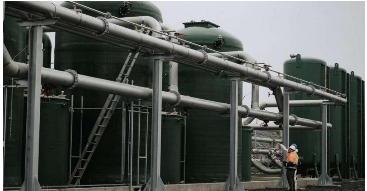
Figure 6 - CrumRubber Biogas Cleaning Plant